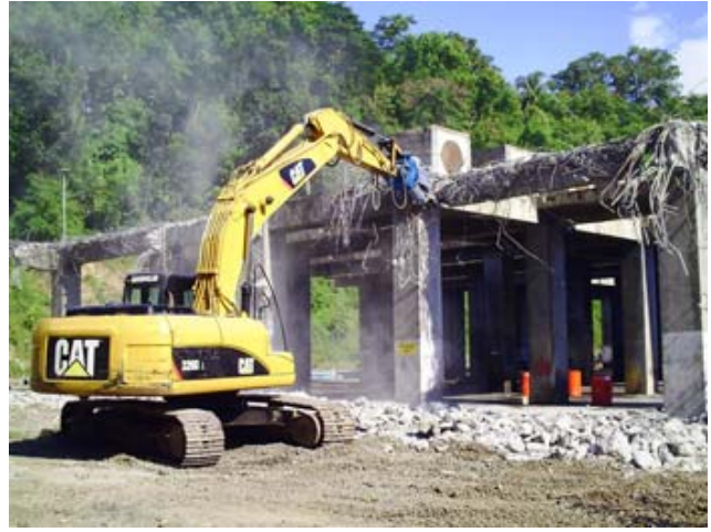
A Cat 320D equipped with an OKADA AIYON TSWK800V ARTS crusher is working on the site to break up the concrete structures.