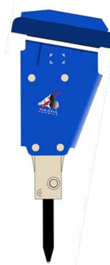
Skid Steer (SS)