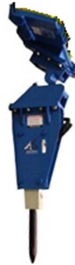
Combination Mini-Exc. & SS