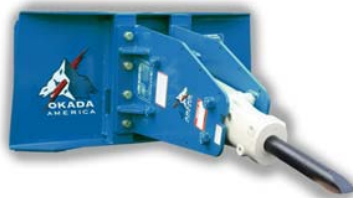
Skid Steer (SS)